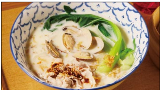
葱花猪肉涮锅, 配以 姜汁豆浆锅配绿叶 GINGER SOY MILK PHO WITH SCALLION, PORK SHABU-SHABU AND GREENS