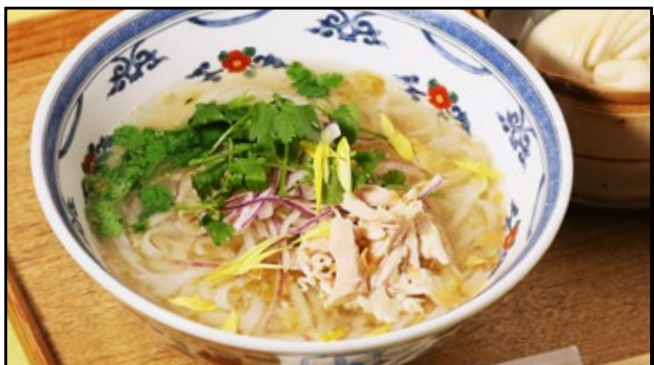
香菜蒸鸡越南河粉 PHO OF STEAMED CHICKEN AND PAKUCHI / PHO GA