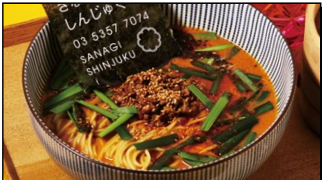
辣到发麻! 麻辣担担面 SPICY HOT NOODLES