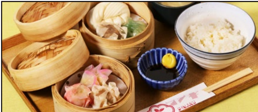
新宿点心套餐 DIM SUM SET MEAL