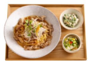
Konana's Deli Set +500円 • A choice of Pasta • Konana's Deli • Homemade Tofu