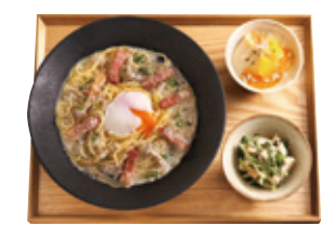
Soy Milk Pudding Set +500円 • A choice of Pasta • Konana's Deli • Soy Milk Pudding