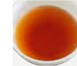
"HOWARI" tea (hot/iced) Rooibos × Lemon Grass