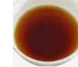
"YURURI" tea (hot/iced) Assam × Ginger