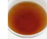
"RABURI" tea (hot/iced) Assam × Cacao