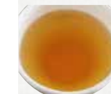
"KURARI" tea (hot/iced) Darjeeling × Iran Iran