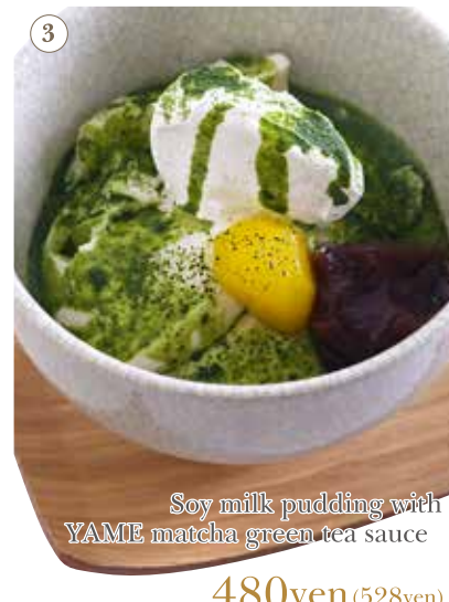
Soy milk pudding with YAME matcha green tea sauce