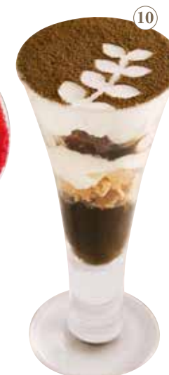
Hojicha / Matcha Tiramisu Parfait