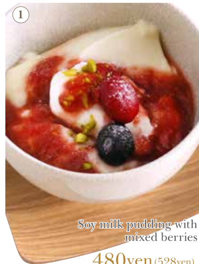
Soy milk pudding with mixed berries

Konana's homemade soy milk pudding has a soft and smooth melt-in-your-mouth taste that is addictive. It is a must-try when you visit Konana.