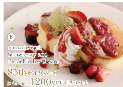
Pancake with Strawberry and Pistachio Ice Cream (8)