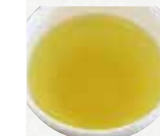
"SARARI" tea (hot/iced) Green Tea × Lemon