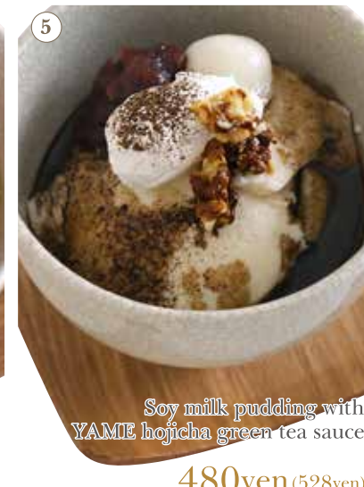
Soy milk pudding with YAME hojicha green tea sauce