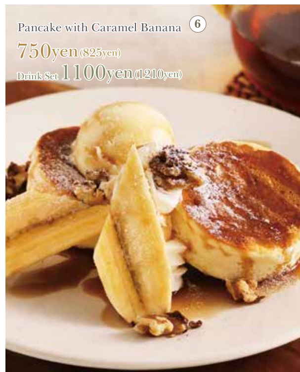
Pancake with Caramel Banana (6)

Moist and fluffy pancakes made with a blend of rice flour and topped with Japanese ingredients with a gentle sweetness. Wheat is also used in addition to rice flour.