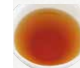
"KARARI" tea (hot/iced) Ceylon × Peppermint

The "Konana Tea" is served in a generous pot with a choice of hot or iced.