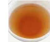
"FUWARI" tea (hot/iced) Roasted green tea × Orange