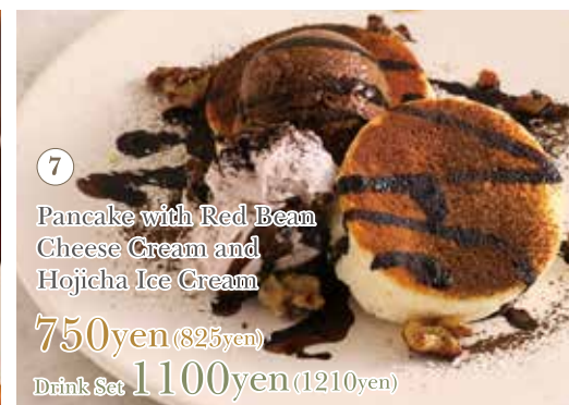
Pancake with Red Bean Cheese Cream and Hojicha Ice Cream (7)