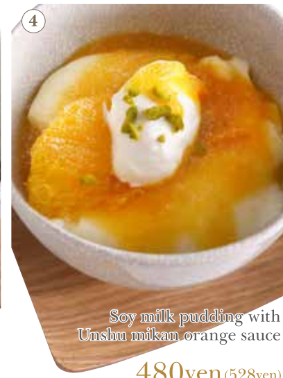
Soy milk pudding with Unshu mikan orange sauce