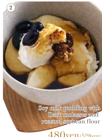
Soy milk pudding with Dark molasses and roasted soybean flour