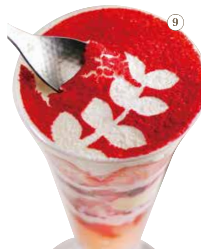
Strawberry Tiramisu Parfait

Finished with a generous amount of mascarpone cream. You can enjoy a variety of flavors such as soy milk pudding, soy milk cookies, fruit, red bean paste, and shiratama (rice flour dumpling).