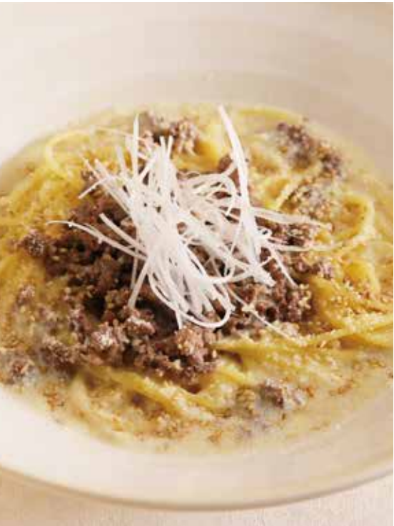
⑥ White Bolognese Made with Ground Awaji Beef, White Sesame, and Soy Milk 1720円

Konana's White and Black Bolognese features luxurious use of beef from Awaji Island, raised in its rich natural environment. The well-balanced blend of fat and lean minced beef is crafted into a Bolognese sauce that pairs perfectly with pasta. The White Bolognese, with its white sesame and soy milk base, has a kick of ginger. The Black Bolognese, rich and savory, is made with Hatcho Miso. Are you a fan of the white or the black?