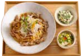
Konana's Deli Set +500円 •A choice of Pasta •Konana's Deli •Homemade Tofu

Konana's "Black" Bolognese is a combination of Awaji beef and Hatcho miso, which is characterized by its astringency and strong flavor, enhances the flavor of the Awaji beef.