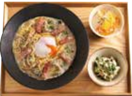
Soy Milk Pudding Set +500円 •A choice of Pasta •Konana's Deli •Soy Milk Pudding