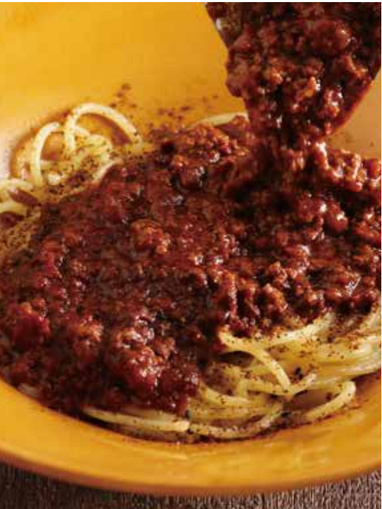
⑦ Black Bolognese Made with Ground Awaji Beef and Hatcho Miso 1680円

Konana's "White" Bolognese is a combination of Awaji beef, white sesame seeds, and soy milk. The tangy flavor of ginger enhances the flavorful Bolognese sauce, giving it an addictive taste.