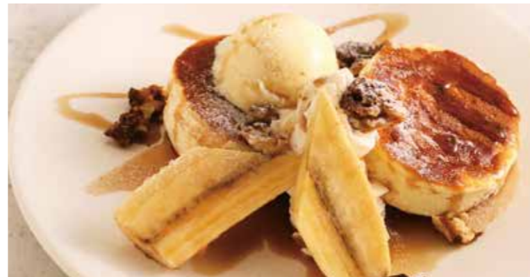
Pancake with Caramel Banana