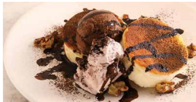
Pancake with Red Bean Cheese Cream and Hojicha Ice Cream