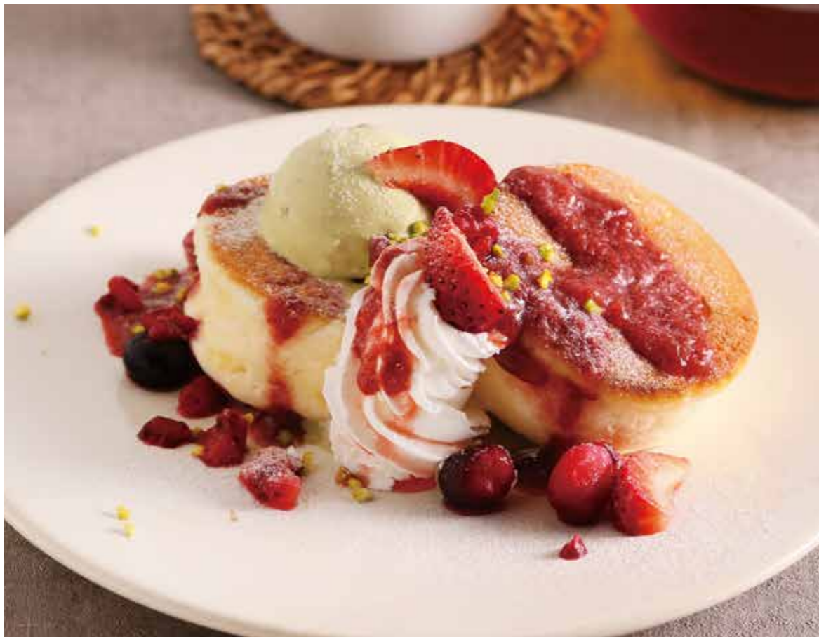
Pancake with Strawberry and Pistachio Ice Cream

Moist and fluffy pancakes made with a blend of rice flour and topped with Japanese ingredients with a gentle sweetness. Wheat is also used in addition to rice flour.