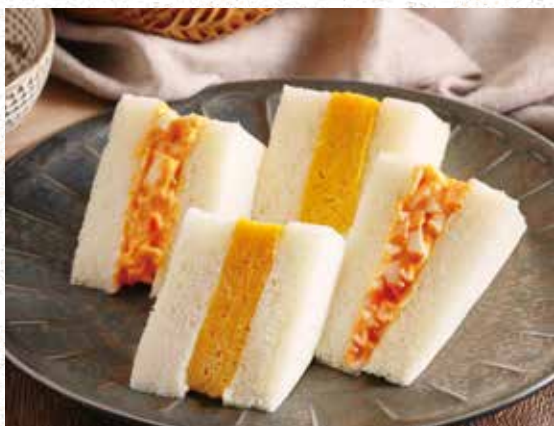
Taiyo Compass Coffee's Special Egg Sandwich