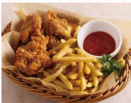
Deep-Fried Chicken and French Fries